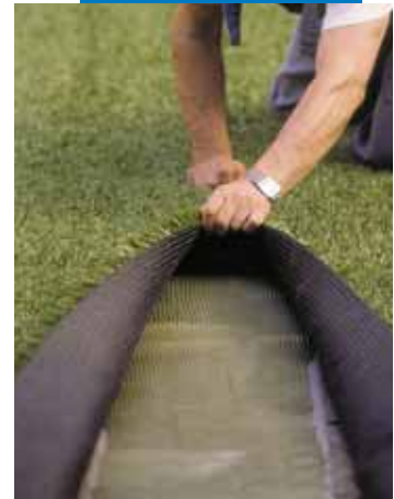
Installation of synthetic grass flooring with Adesilex G19 - S.Siro Stadium - Milan - Italy