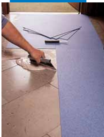
Laying PVC on a non absorbent substrate with Adesilex G19