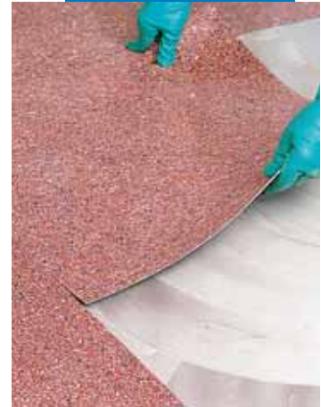
Installing PVC with Adesilex G19