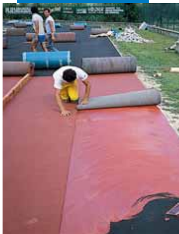
Installing rubber flooring with Adesilex G19