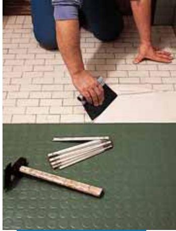
Spreading Adesilex G19 with a notched trowel

Special colours can be requested (min. 600 kg).